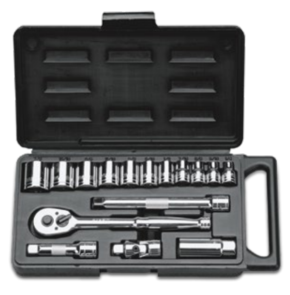
Part No. SC20001A