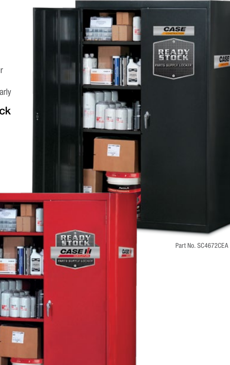
Part No. SC4672CAA

<sup>+</sup> Manufacturer's limited warranty.