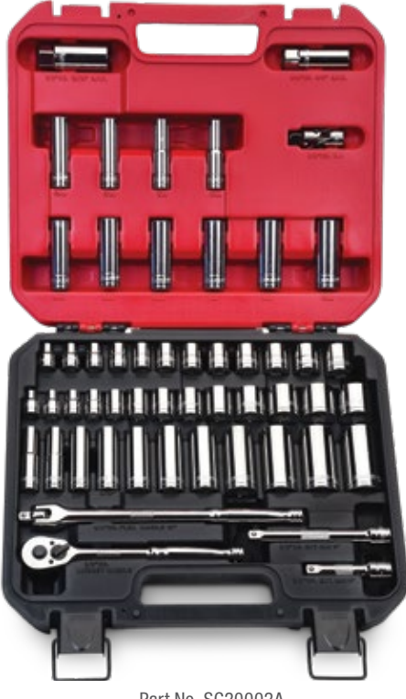
Part No. SC20002A